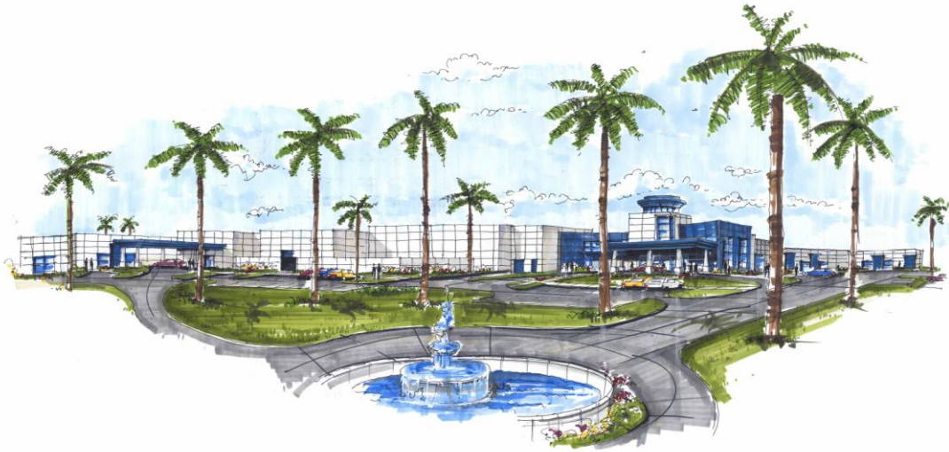
PORTMORE MEDICAL CENTER PORTMORE, JAMAICA - CAYJAM DEVELOPMENT LTD. MAY 18, 2006

The basic design of the hospital will be a single storey building that facilitates access and provides quality ambiance (see figure below). These designs have been successfully developed and implemented by the potential operator of the hospital, CHA.